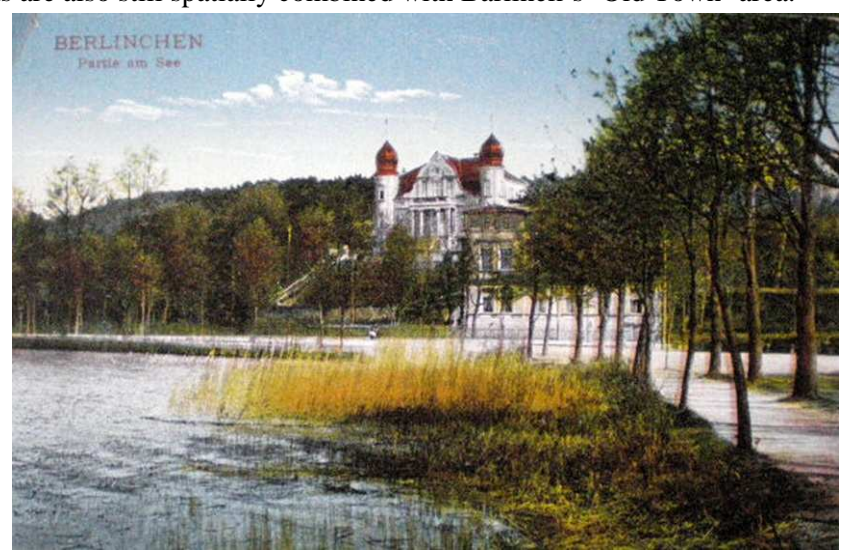
Fig. 1. Pre-war postcard of Berlinchen, showing the excellent location of the Villa Duelfer against the forest and lake.

three sides is a forest (Fig. 1). Looking at the location and urban composition of the area, the villa's grounds blend into the green, tourist part of the place, which is slightly spatially separated from the centre in such a way that the two zones are axially linked by the clear, simple passage of Strzelecka street. The green areas are also still spatially combined with Barlinek's 'Old Town' area.